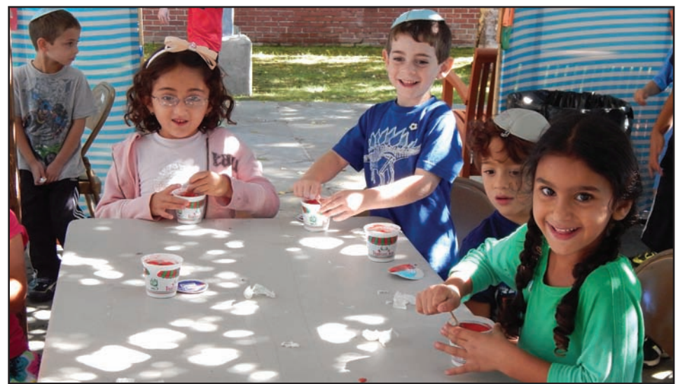
Temple Israel Religious School students spent sunny afternoons in the congregation's sukkah

I wish you a sweet, blessed 5774. Shalom.