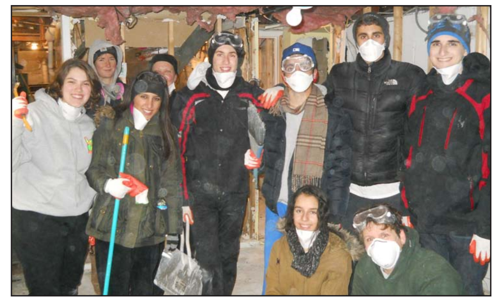
Youth House students cleared an entire Long Beach basement.