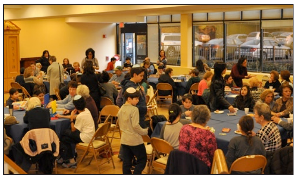
... and entertained Atria seniors in Temple Israel's Multipurpose Room.