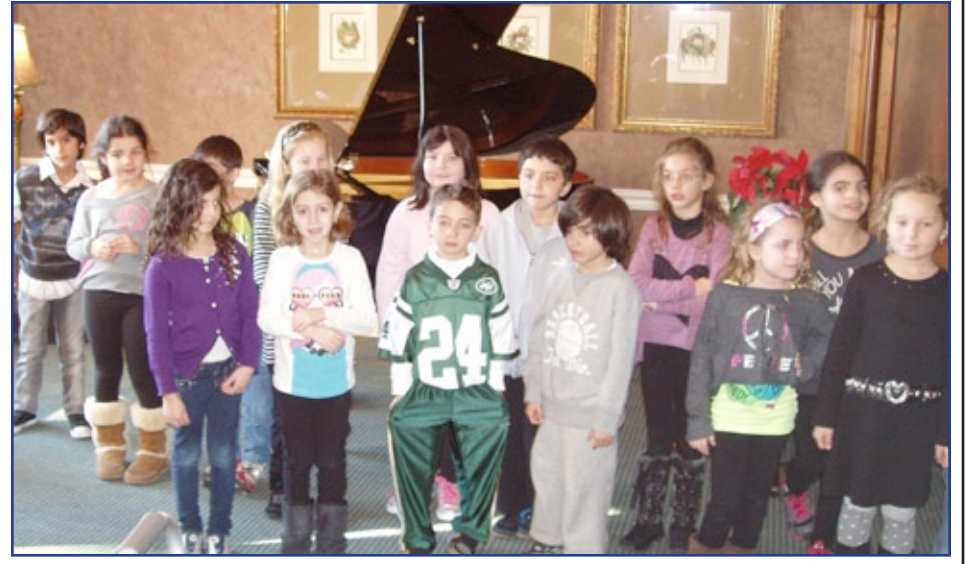
A Religious School mitzvah project: singing holiday songs for Great Neck's seniors.

At right, in the top and middle pictures, are the Alef children at Atria—Great Neck Road. The classes ——Continued on page 11