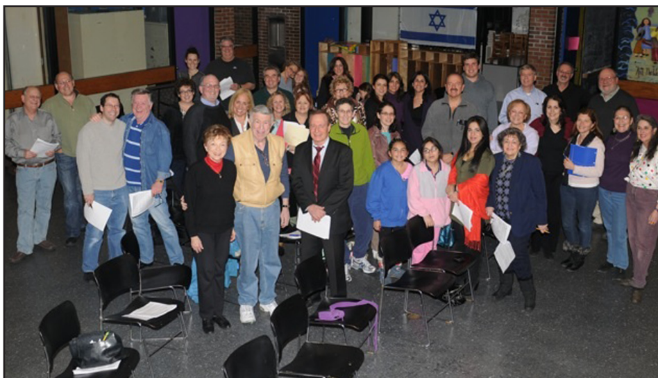
A large turnout gathered for the Temple Players cast call earlier this week.

Broadway is coming to Temple Israel in a new production featuring the largest cast ever of the Temple Israel Players.