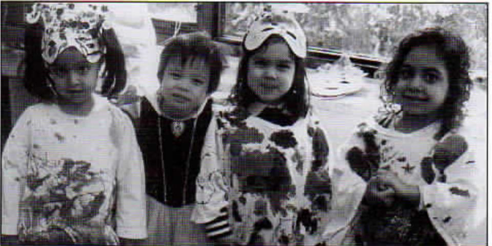
Purim at Beth HaGan!

I would also like to thank everyone who has been so kind to us in helping us adjust to our new home, and to those who have donated toys, books and games to the school. A special thanks goes to the members of the PTA, who are always available to service the needs of the Beth HaGan children.