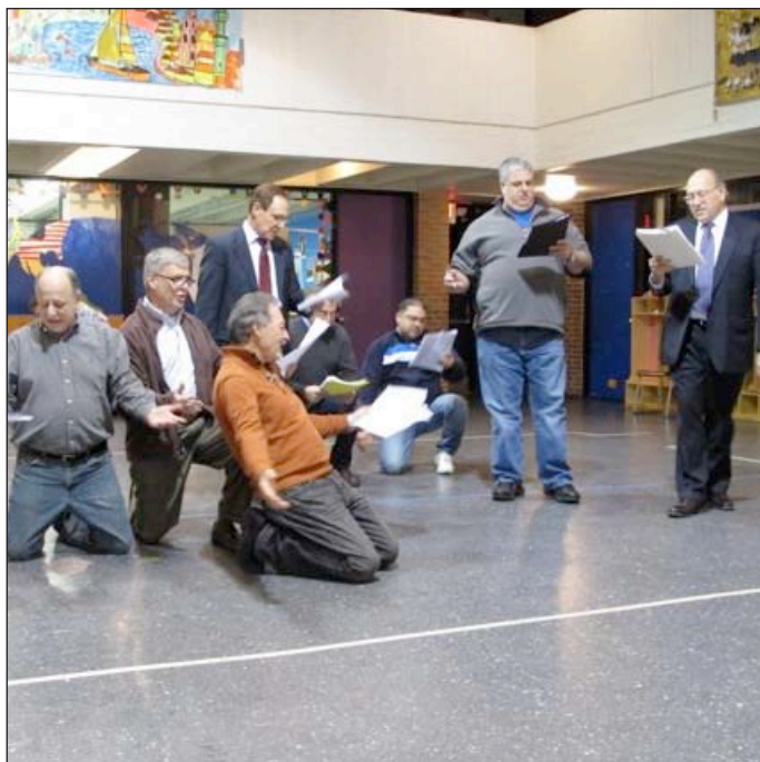
Temple Israel Players are rehearsing for their spotlight moment.